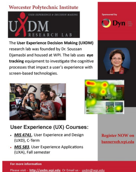
Traditional Print Poster

To incorporate the AR items into the poster, as mentioned above, we used the commercially available AR mobile application, Layar. We used the Layar design tool to overlay AR content into a previously uploaded image of our poster. When a user loads the Layar application on his or her internet connected mobile device, and points the device's camera towards the poster, Layar is able to recognize the image and display the AR information on the device. We downloaded Layar on an iPad 3 running iOS 6, which was used in the experiment.